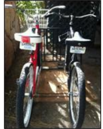
L-R lobby living room, penthouse suite, pair of beach cruiser bicycles